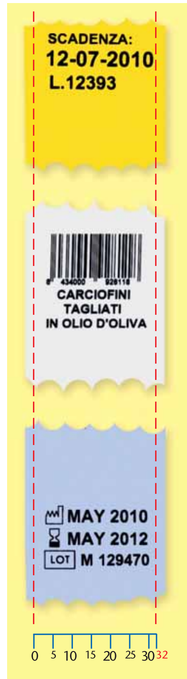
The 32 mm width of the print head enables printing of most used variable data.

The SWING 1.ie is designed and produced entirely in Italy by EIDOS spa.